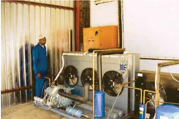
A general type of refrigeration chamber is in use.

Each refrigeration chamber has a separate compressor. (When referring to a compressor, it includes all pipes, fans and other relevant accessories.) The insured does not have a maintenance contract in place because he is of the opinion that due to the involvement of the personnel they will immediately notice if something is wrong.